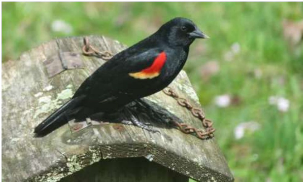
Red-winged Blackbird Windham Township

The Community Planning Office continues to work together with all 23 local municipalities to routinely maintain their most current ordinances and/or plans when needed. This includes Zoning, Subdivision and Land Development, Stormwater, Floodplain and Comprehensive Plans. These documents are available either online or through the local municipal offices.