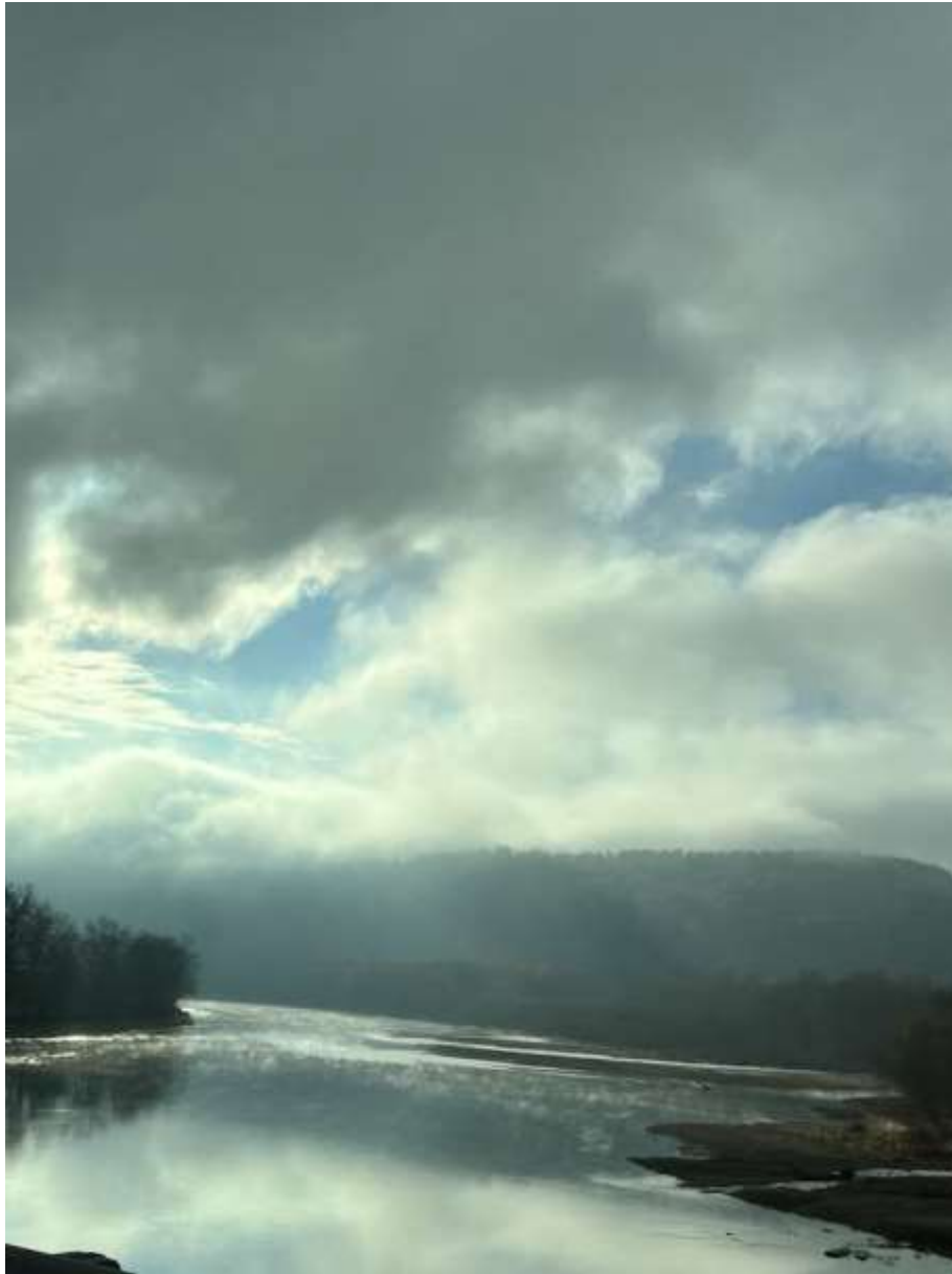
Mist on the Susquehanna Washington Township