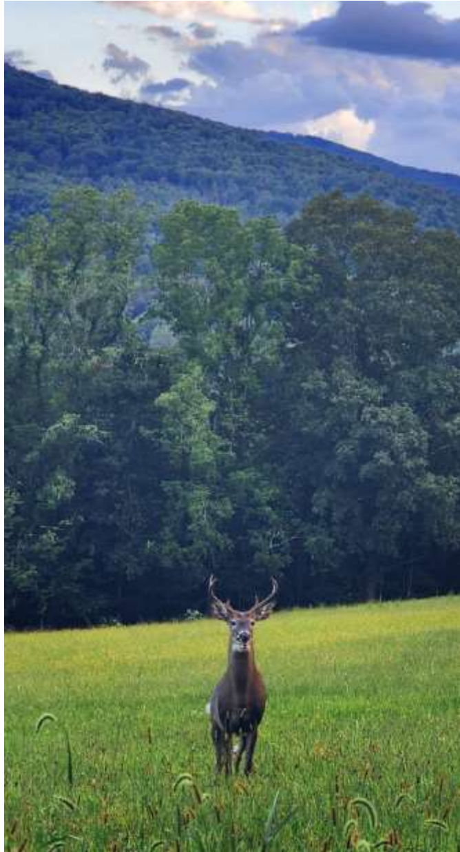
Buck on Nimble Hill Mehoopany Township

The Chronological Report was completed for every month in 2023. This report is designed to lay out the daily correspondence that is received by the Planning Office. This will continue to be on the agenda of the Planning Commission Board Meeting each month.