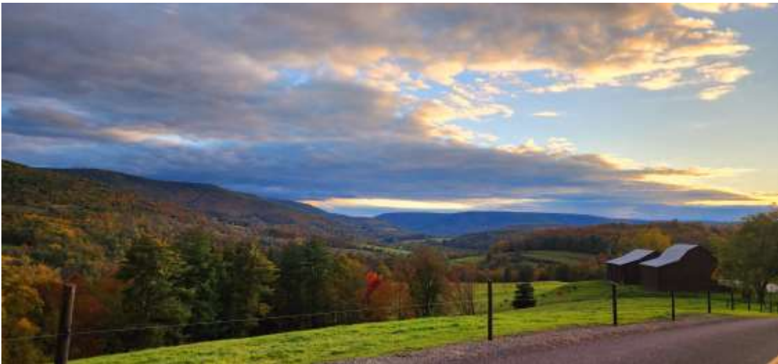
Autumn on Nimble Hill Mehoopany Township

Pennsylvania Trails Conference September 2023