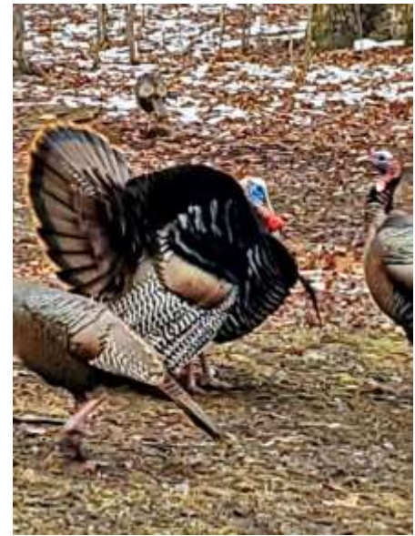
Tom Turkey Tunkhannock